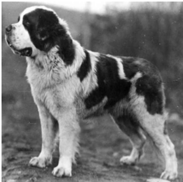
BOB: CH Rasko V D Reppisch