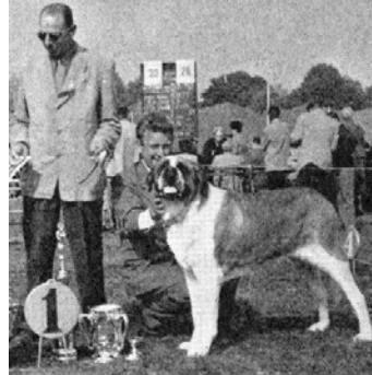
BOS: CH Heilmans Julia V Gerd

Photo needed. If you have a photo of this dog please contact me at the E-mail address posted on the web page