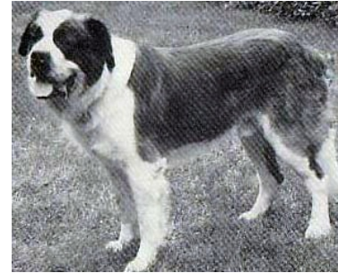
WD/BOW: Lord Von Sauliamt