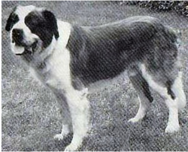
BOB: CH Lord Von Sauliamt