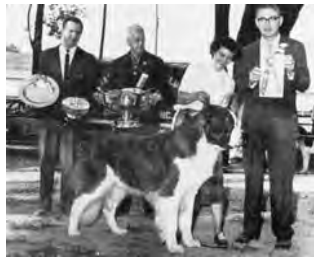
BOB: CH Harveys Zwingo Barri V Banz