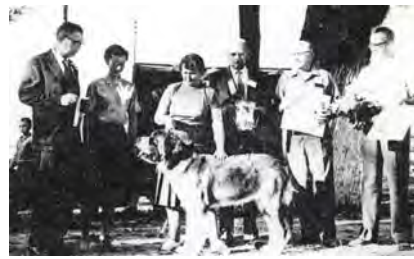
BOS: CH Lady Heidi Of Carmel Hof