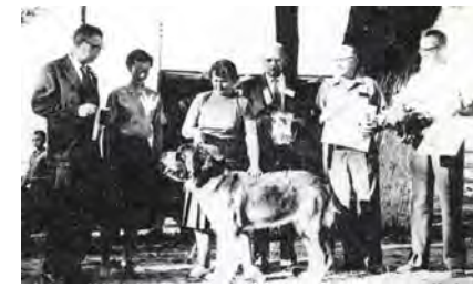
WB: Lady Heidi Of Carmel Hof