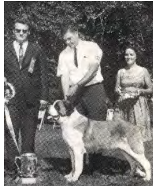
BOS: CH Asta V Muggenguhi