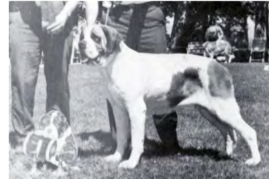
WB: Stanridges Samantha V Riga