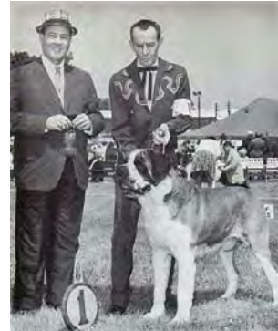
WD/BOW: Beau Cheval Golden Caesar