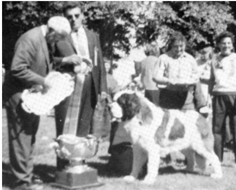
BOB: CH Titan V Mallen