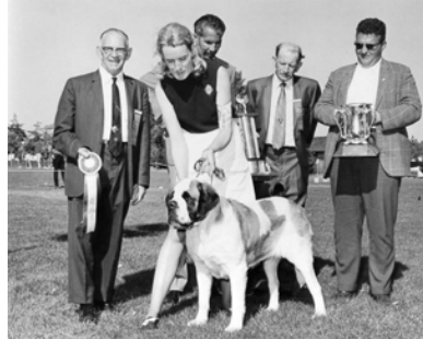
BOS: Beau Cheval Traci La Mardoug