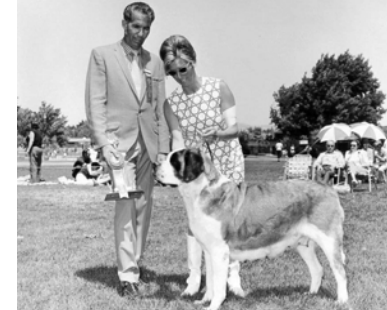
WB: Charlinores Grand Ursula