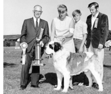
WD/BOW: Mt Chalets At Last