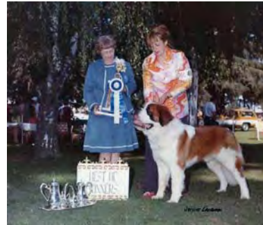
WD/BOW: Bergundtal Jack-A-Dandy