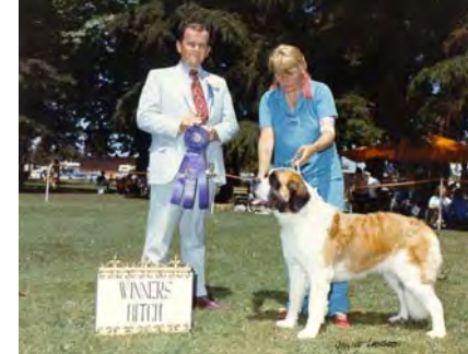
WB: Mt Chalets Daphne At Last