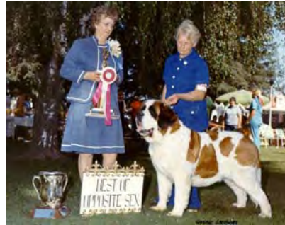
BOS: Sanctuary Woods Kleona