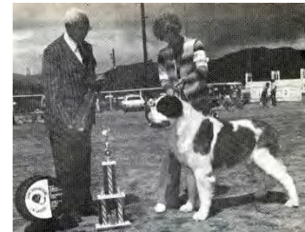
WD: Almshaus Nimbus