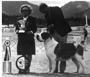
BOS: CH Opdykes Pure Sugar