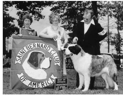
BOS: CH Sherimins Erica