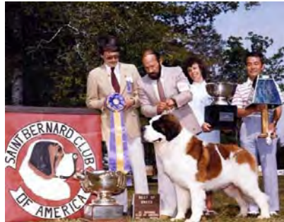
BOB: CH Cunos Claus V Cusumer