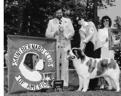
WB/BOW: Excaliburs Lady Anastasia CD