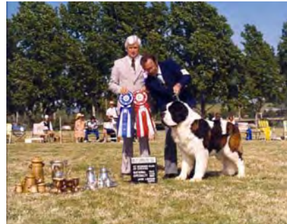
BOS: CH High Chateaus Kris