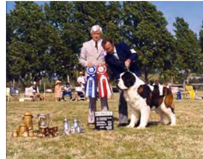
WD/BOW: High Chateaus Kris