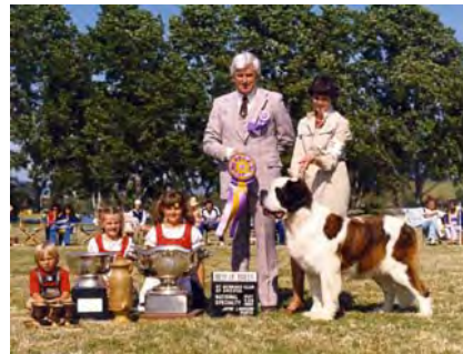
BOB: CH Sherimins Erica