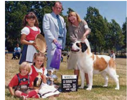
WB: Dilettantes Home Spun