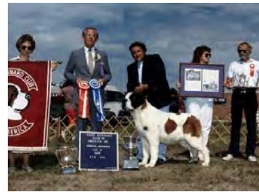
BOS: CH Opdykes Emerald