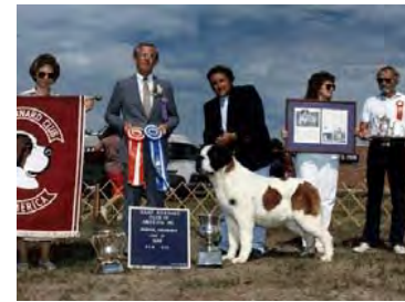
WB/BOW: Opdykes Emerald