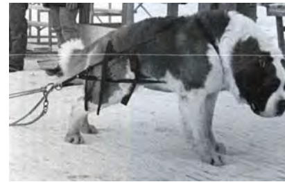
CH World Tops Brutus V Opdyke WPX Pulled 1940 Pounds