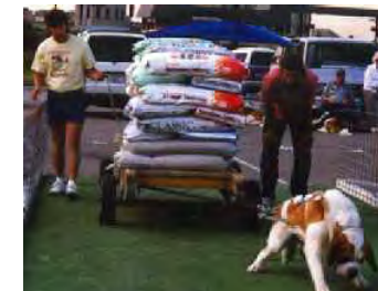
Sebrings Summer Breeze WP Highest Percentage 16.44%