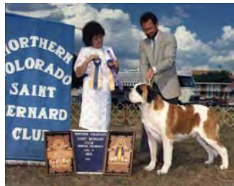
HIT: CH Windward Aint No Saint Judge: Charles Mulock