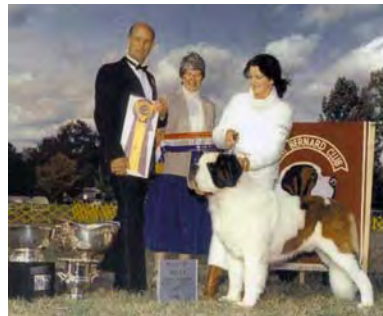
BOB: CH Sandtrees Beach Boy