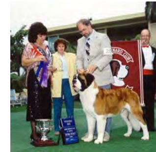
WD: Revilos Houston V Dolly