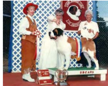
BOS: CH Cache Retreat On A Clear Day