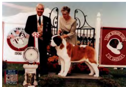
BOS: CH Cache Retreat Academy