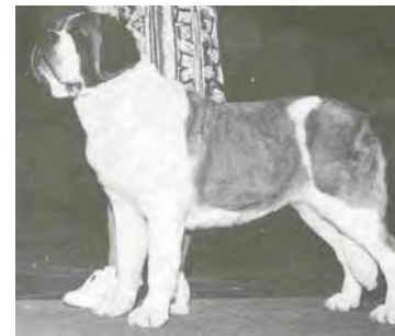
CH Lil Jons Image O'Meg WP Pulled 1057 Pounds