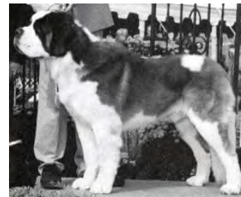
WD/BOW: Slatons Power Play