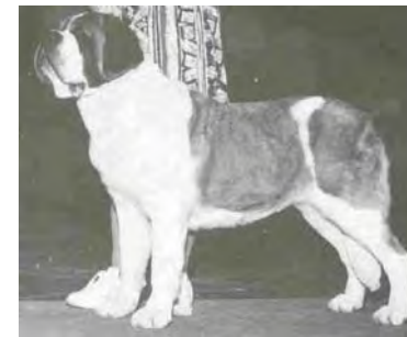
CH Lil Jons Image O'Meg WP Highest Percentage 7.24%