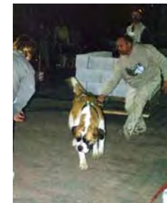
CH Victorys Amber Ice V Stoan CD, DD, WP Highest Percentage 18.40%