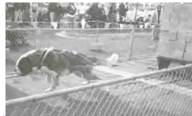
CH Sky Meadows The Ice Man