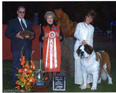
BOS: CH Majestics Cenicienta