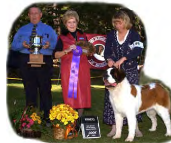
WB/BOW: Cache Retreat Annies Song