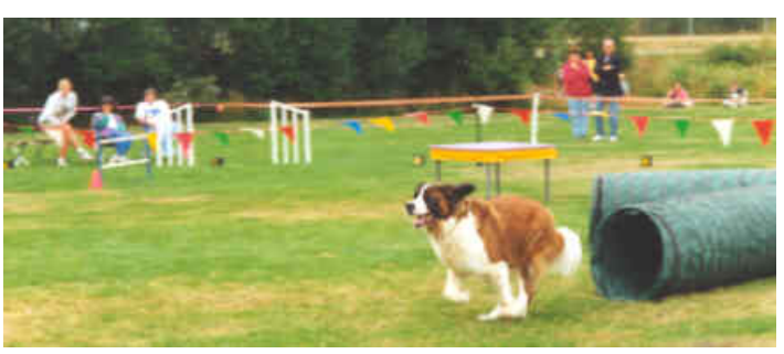
Out of the Tunnel and Heading for the Finish!

First Saint Bernard to Earn The Agility Title Novice Agility Jumpers With Weaves (NAJ) March 31, 2001