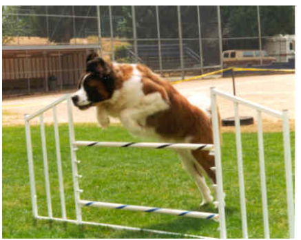
Clearing a Jump