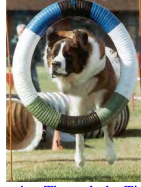
Jumping Through the Tire