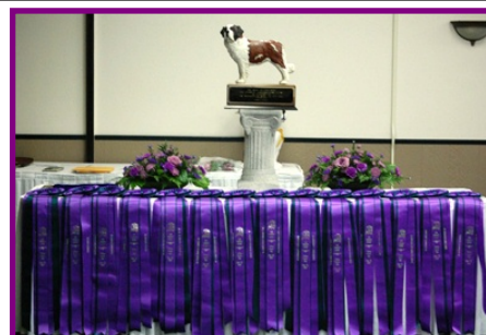
Trophy and Ribbons