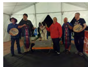
Most Weight Pulled GCHS Victorys Unleash The Dark Knight CGC WPX Pulled 1709 Pounds