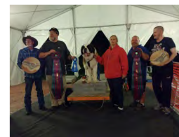
Highest Percentage Pulled GCHS Victorys Unleash The Dark Knight CGC WPX Highest Percentage 10.29%