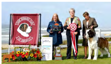
BOS: CH Alpine Mtn Rainier