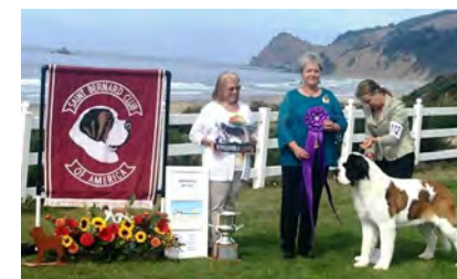
WB & BOW Cache Retreat Solitude