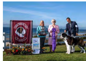
WD: Summerlyn's Luther