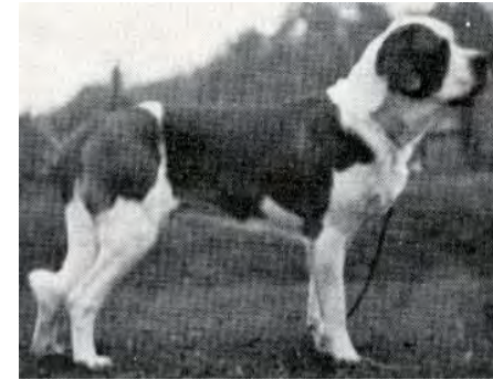
WD: Carlo V Sunny Slopes