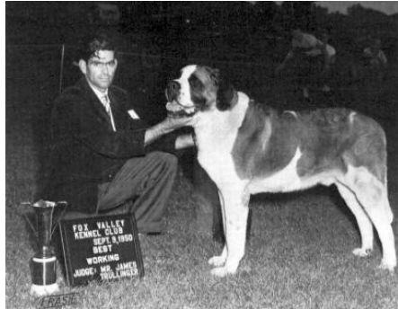
BOB: CH Gerd V D Lueg V Edelweiss