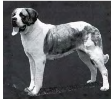
WB/BOW: Aline V D Roth