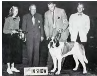
BOS: CH Gerda V D Lueg V Alpine Plateau