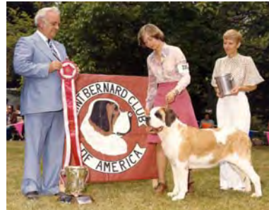
BOS: CH Echos Heather V Yondo