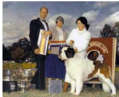
BOB: CH Sandtrees Beach Boy