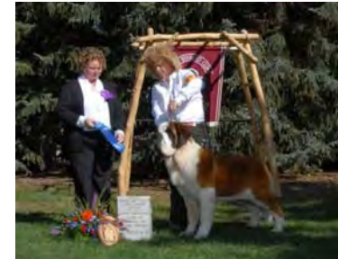
WB: Whoodcrest Liberty