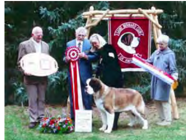
BOS: CH Jamelles U Outabe In Pictures