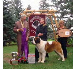
WD/BOW: Lasquites Orlando V Hans