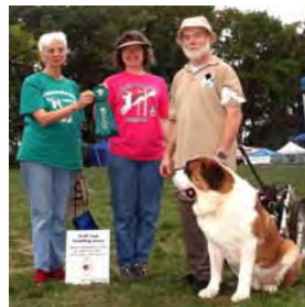
Draft: Excaliburs Remember The Knight CD RE DD WPS