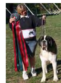
Highest Percentage 15.25 % CH Vicdorys Jem Stone Sandcastle WPX