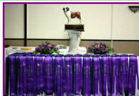
Trophy and Ribbons