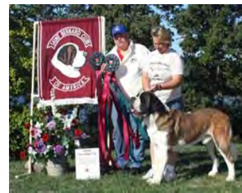
Pulled 2425 Pounds CH Vicdorys Jem Stone Sandcastle WPX