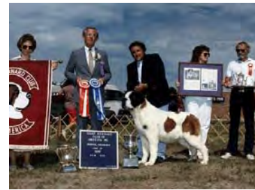
WB/BOW: Opdykes Emerald