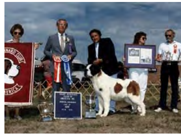
BOS: CH Opdykes Emerald