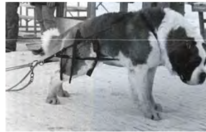
CH World Tops Brutus V Opdyke WPX Pulled 1940 Pounds