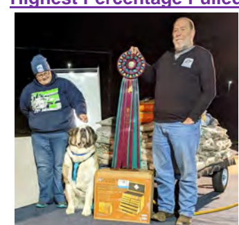
21.57% GCH Jeul Kreek's A Rockstar for Vicdory CD BN RI CGCA WPS