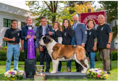
WB Cache Retreat Thelma Highest Percentage Pulled