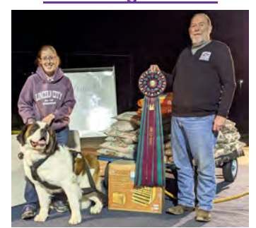
2860#s CH Blue Collars Patriot Safe Harbor