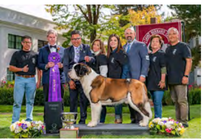
WD & BOW: Alpine Mtn Gordon V Notorious Most Weight Pulled

The BOS bitch was ineligible to be shown as her owner judged the Sweepstakes.