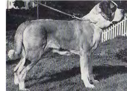
WB: Bellina V Rigibuhl V Alpine Plateau