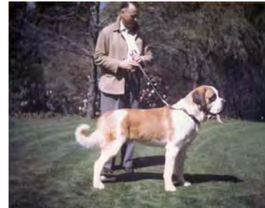
WD/BOW: Questor V Alpine Plateau