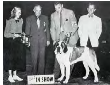
BOS: CH Gerda V D Lueg V Alpine Plateau