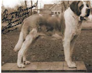
BOB: CH Gerd V D Lueg V Edelweiss