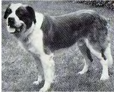
BOB: CH Lord Von Sauliamt