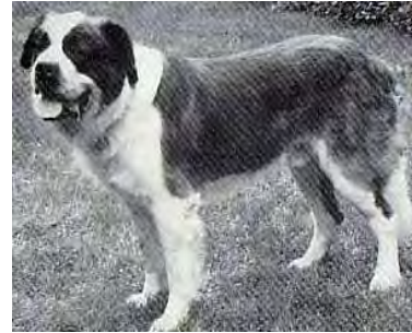
WD/BOW: Lord Von Sauliamt