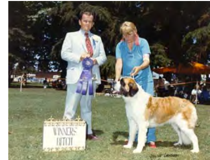
WB: Mt Chalets Daphne At Last