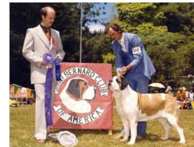
WB: Cypress Woods Going Sky High