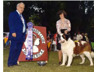
WD/BOW: Bergwachts Far West