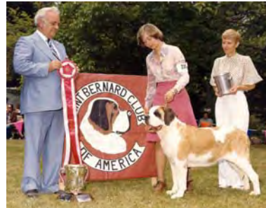
BOS: CH Echos Heather V Yondo