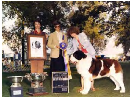
BOB: CH Cypress Woods Baccarat