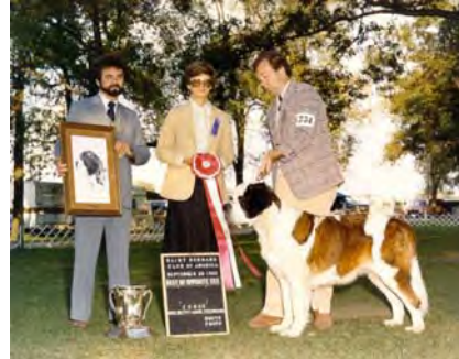
BOS: CH Sherimins Erica