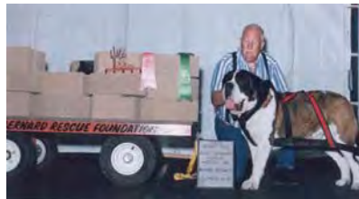
Montana Mtns Little Mac Pulled 3020 Pounds

Photo needed. If you have a photo of this dog please contact me at the E-mail address posted on the web page.