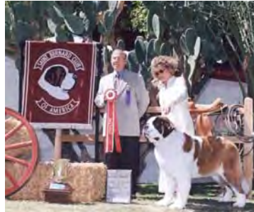
BOS: CH Majestics Cenicienta