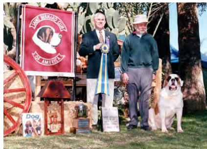
HIT: Excaliburs Knight Of The Realm Judge: Ken Buxton