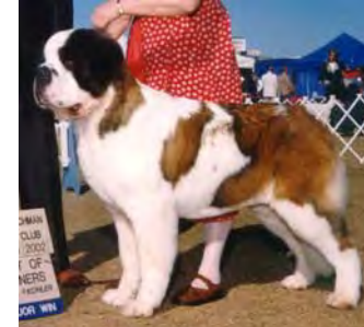
WB: Cache Retreat Sheer Ecstasy