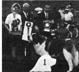
BOS: CH Gerlo V Sauliamt