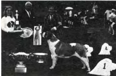
BOB: CH CH Rudes Hi Jinks V Buster