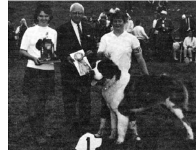
WD: Morgans Hans of Hoosierland