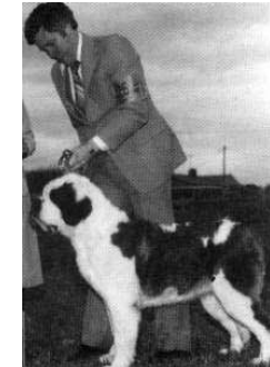
WB: Samaritans Ebony