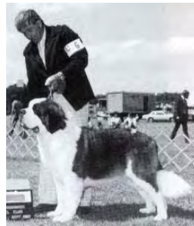
BOS: CH Fairy Tails Lucerne