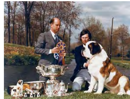
WD/BOW: High Chateaus Caesar