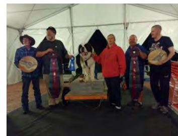
Most Weight Pulled GCHS Victorys Unleash The Dark Knight CGC WPX Pulled 1709 Pounds