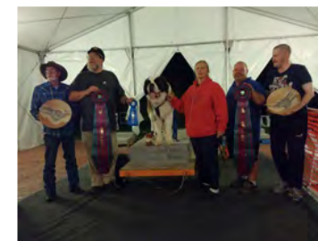
Highest Percentage Pulled GCHS Victorys Unleash The Dark Knight CGC WPX Highest Percentage 10.29%