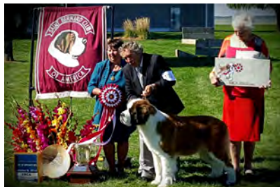
BOS: GCHS Sandcastles Indecent Proposal