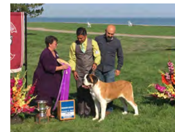
WB: Wasatch Giants Spot V Alpine Mtn