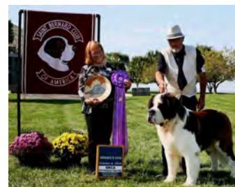
WD BOW: R'Solitaire Astro Montmart