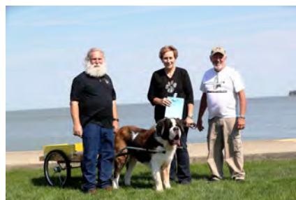
Draft Alpine Mtn's Danc'n With The Starz CD BN RAE2 CGC NDD