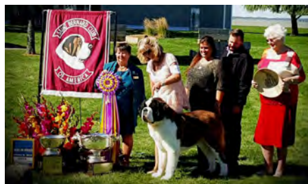
BOB: GCH Nobels Fierce Warrior V Jamelles